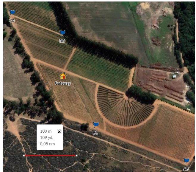
Fig. 2. Node placement in the vineyard.

The gateway node was installed and activated first, after which the remaining nodes were enabled one by one. After a node is powered on, it waits for a GPS lock to synchronise the onboard RTC. Once the RTC is initialised, nodes will start the route discovery process. In each global transmission slot (global transmission slots are open every 10 seconds), each node is given a 20% chance to send an RREQ, if no routes to the gateway node are known, otherwise, if at least one route to the gateway is known, the edge nodes will listen in the global transmission slot. This is to reduce congestion at the start of